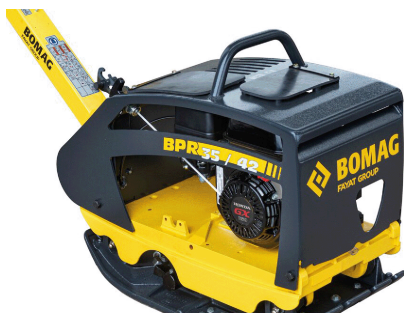
Robust and reliable Best component protection