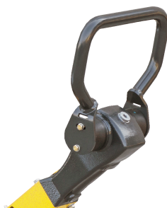
Precise and save to operate Comfortable control lever