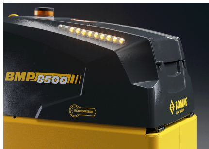
Higher quality, lower costs ECONOMIZER - The compaction display (optional)