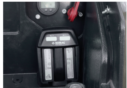
Integrated charger (optional) Charge second battery during radio operation