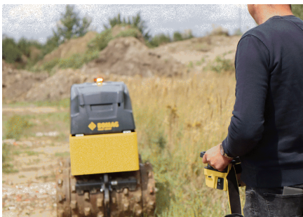
Radio/cable remote control Fast coupling when service is needed